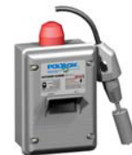
Outdoor SmartFilter® Alarm Polylok, Zabel & Best filters accept the SmartFilter® switch and alarm.